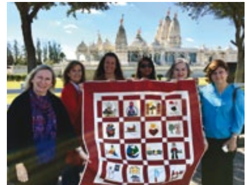
FAUSA promoted the Target Project at their Annual Meeting and Getaway by raffling a quilt made from squares sourced from CRP's Hope Workshop.