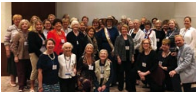
FAUSA Getaway attendees