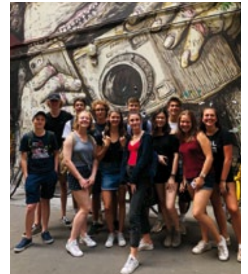
FAWCO Youth Cultural Volunteers 2018 in Berlin, Germany