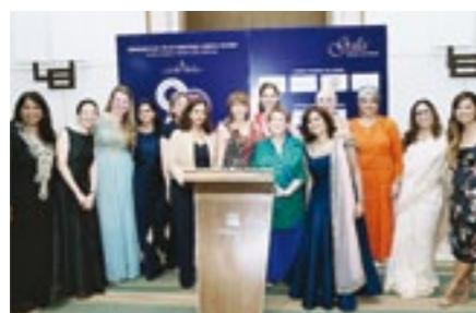
The ACIW Gala Committee