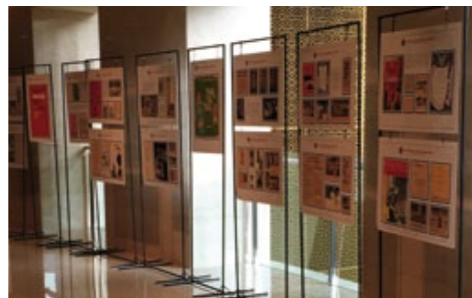
Panels from the ACIW memorabilia walk

Here's to 90+ more years serving as a home away from home for Mumbai's expatriate women!