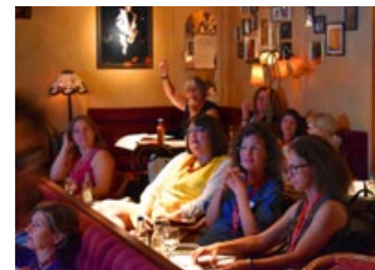
Region 6 meeting participants in the "Innere Enge" jazz club room

All in all a very packed and inspired two days in Bern when FAWCO Met Jazz!!