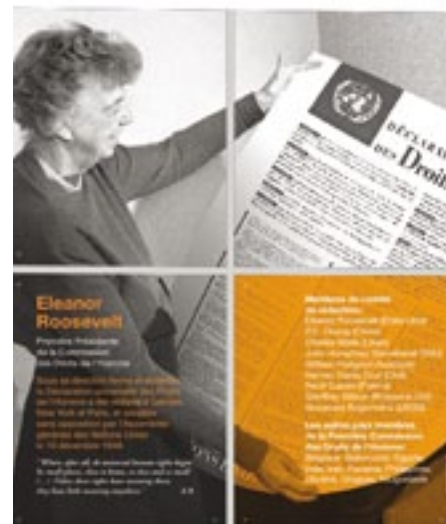
Eleanor Roosevelt with the Universal Declaration of Human Rights