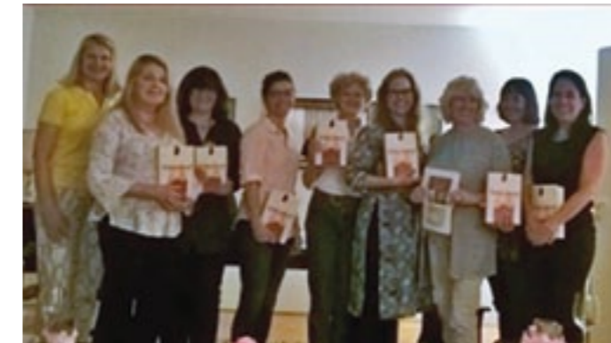
September 12, 2018, FAWCO Summer Global Read Book Discussion. In collaboration with AIWC Cologne. Educated- Tara Westover.

proposed a Development Grant mapping project focusing on Education involving the FAWCO Foundation Archives. In honor