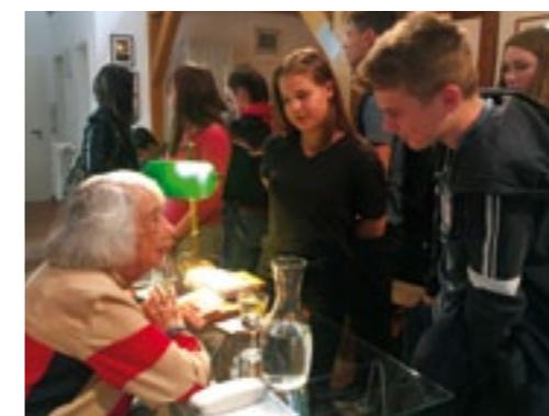
Margot Friedländer 96-year-old Holocaust survivor speaking to the Youths

This year's group served refugees, homeless, disabled, and severely ill people living in Berlin through their volunteer work