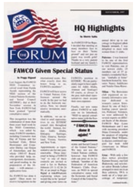
FAWCO Forum ECOSOC November 1997