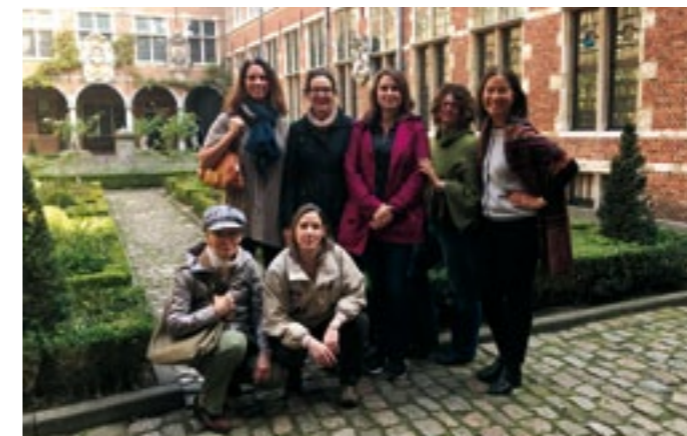
Region 4 participants on a walking tour of Antwerp

Our evening gala featured not only a performance by the Flanders Ballet School, an AWC Antwerp sponsored charity, but the presentation of a 10,000 Euro cheque to the Middelheim Hospital, part of our ongoing support for their creation of a new Caring Hearts Breast Lounge. Our aim was to share the magic and I think we succeeded.