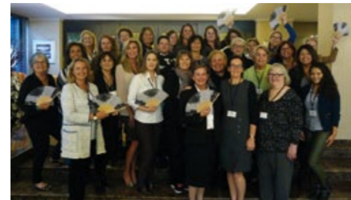
Region 4 participants showing that they are "fans" of The FAWCO Foundation.

Women Worldwide". We chose the kaleidoscope as a symbol for this Regional as it is made up of numerous facets: on its own, each individual facet has different colors, shapes and sizes, but the real magic happens when these facets come together.