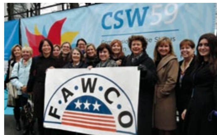
FAWCO delegation at CSW59, March 2015