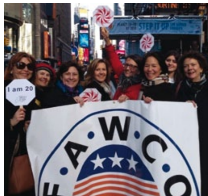
FAWCO at the Women's March in NY, March 2015