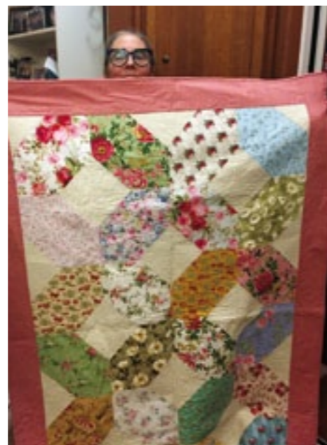
The quilt raffle raised a considerable sum for FAWCO's Target Project.