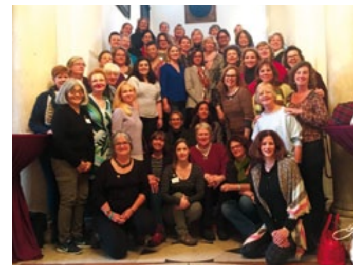
Not only was every club in the region represented, but MIWC welcomed delegates from seven clubs outside our area.

With a sparkling wine toast and keg-tapping, the Munich IWC welcomed more than 50 guests to the Beer Keller at Der Pschorr am Viktualienmarkt for the kick-off event of FAWCO's Region 5 Meeting.