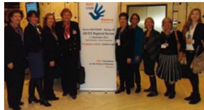
Geneva NGO Forum, November 2014

FAWCO's Target Program, Global Issues Teams' activities and The FAWCO Foundation's Development Grants, demonstrate our ongoing commitment and contributions to the UN's development agenda (Millennium Development Goals pre-2015, Sustainable Development Goals since 2015).