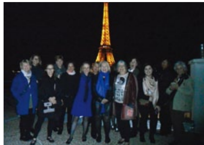
The evening's high point ... the rooftop view!