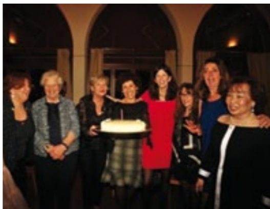
AIWC Genoa members with anniversary cake.