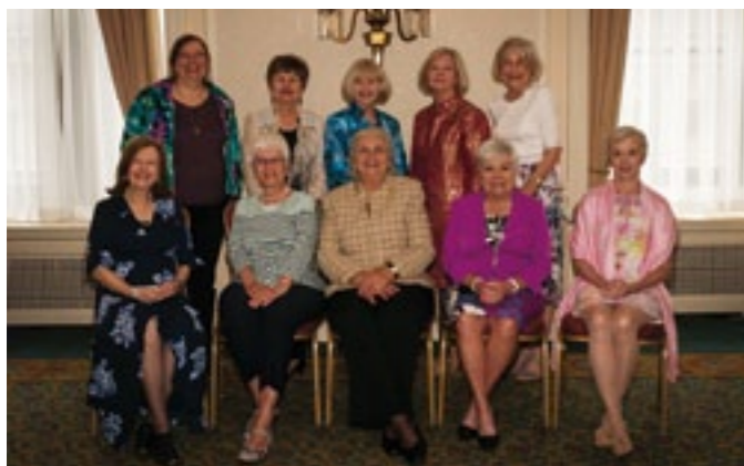
AWC Toronto past presidents.