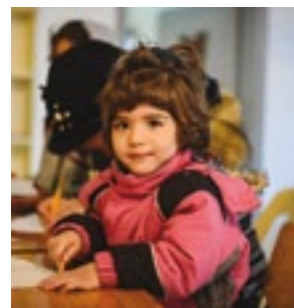
At CRP's weekly arts workshop, women and children have the opportunity to express their creativity through different artistic mediums.

(ICDL) computer skills training, and 45 women and girls who have their ICDL will be taught computer coding. In addition, 60 women will complete an economic empowerment program which provides training in cosmetology and self-employment skills. That means providing 180 women skills to generate income!