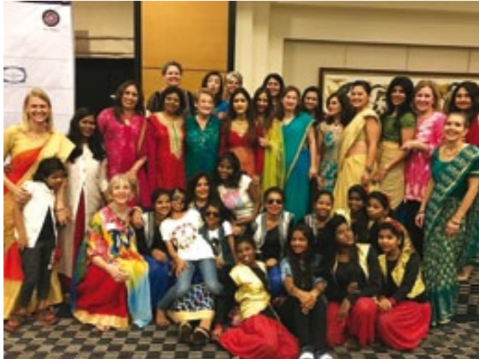
Dancers from the Sharanam Centre for Girls with members of AWC Mumbai at the "Mumbai Masti" evening.

Avasara aims to change mindsets about the value of girls. We want to create home-grown success stories that upset the narrative told about women. This way, we believe we can change gender mindsets within one generation. It just takes role models of success from varied communities.