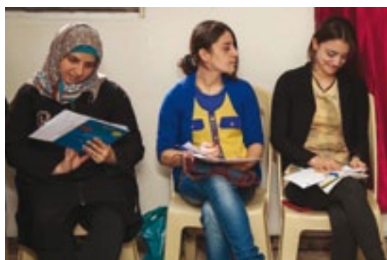
Women help each other out during an English lesson.

Women's Vocational Training - 120 women will complete the International Computer Driving License