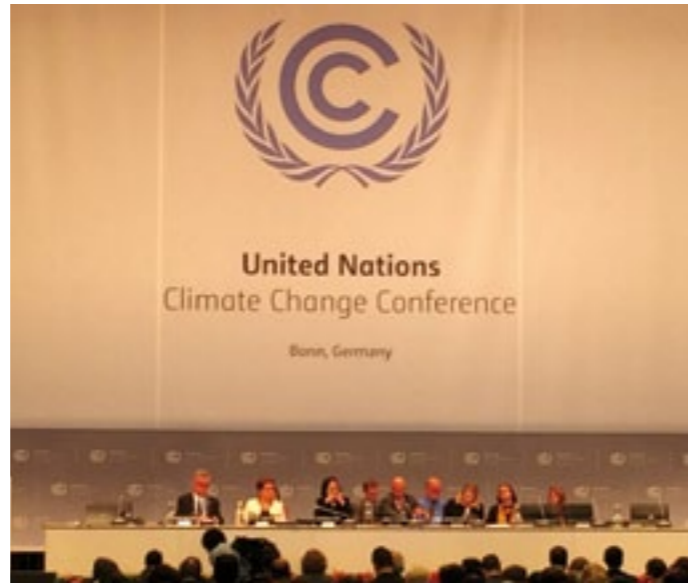
At the UN Climate Conference in Bonn, May 2017

In December 2015 at COP21, the Paris Agreement was adopted governing emission reductions starting in 2020. FAWCO's