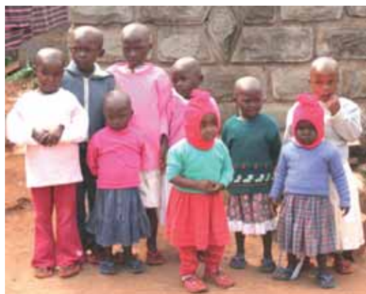
Children who will benefit from the Angels of Hope Peaceful Home for Children

Peaceful Home for Children is a rural project. The children, orphaned by AIDs or disabled, have no parents and little hope for the future. The grant will help construct and furnish a safe and secure compound of six permanent family-style houses.