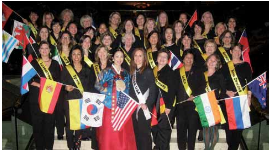
"Parade of Nations" highlighting all the countries where FAWCO is represented