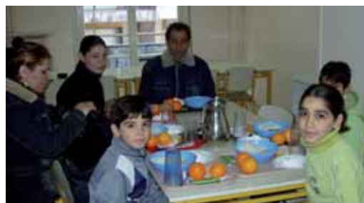
One of the 80 refugee families receiving aid

The Caritas Athens Refugee Program offers services, including monthly food bags to around 80 families. The contents contain essential items, including a liter of olive oil, used daily in Asian and African cooking. Currently financed by the center, this Grant will purchase this otherwise expensive commodity for the food bags.