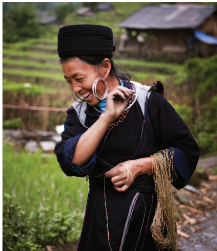
From top left, clockwise: More bread, more jobs. “I wish I could walk around without being hurt by inappropriate words.” ; Hmong Woman in Viet Nam: A Hmong hill tribe woman at work in Sin Chai, Viet Nam. Women enjoy playing soccer at a city park in Kolkata, India.