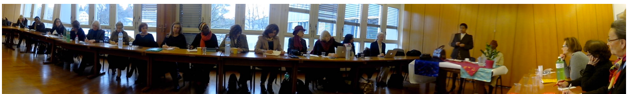
NGO CSW Geneva members meeting with UN Women Executive Director Phumzile Mlambo-Ngcuka on 15 January 2014

Let's work together to act | advance | achieve | women's rights!