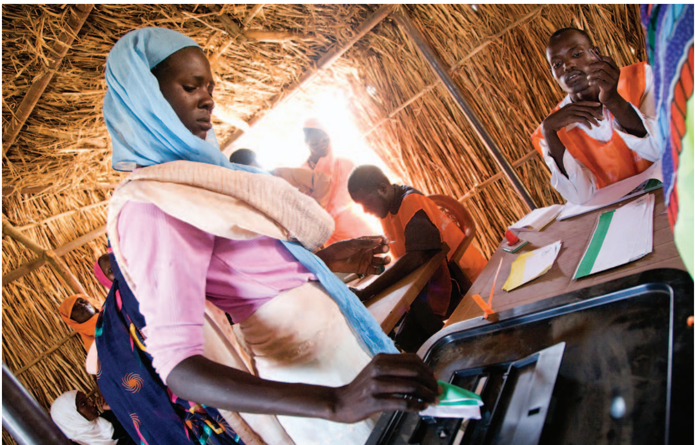
From top: Young woman from a fishing community in West Bengal in eastern India.; North Darfur Woman votes in Sudanese national elections..