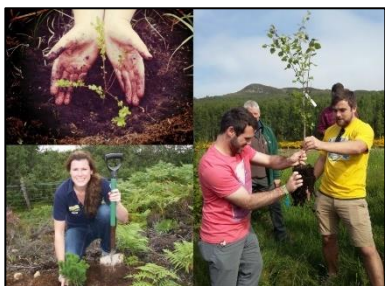
Trees for Life