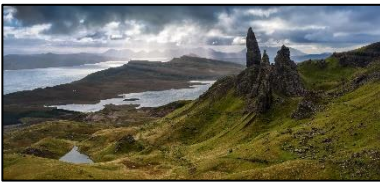
Old Man of Storr