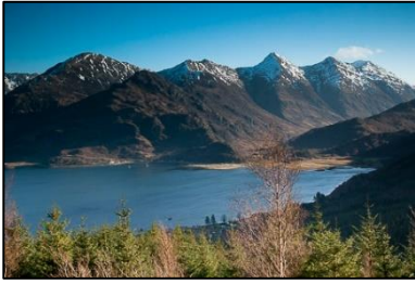
Five Sisters – Glen Shiel