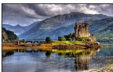
Eilean Donan Castle