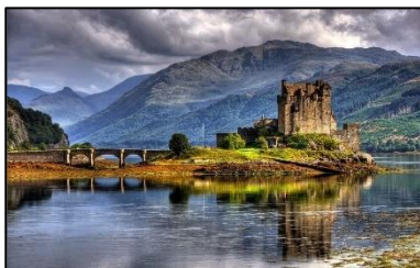
Eilean Donan Castle