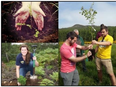
Trees for Life