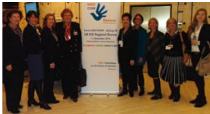
Geneva NGO Forum, November 2014

FAWCO's Target Program, Global Issues Teams' activities and The FAWCO Foundation's Development Grants, demonstrate our ongoing commitment and contributions to the UN's development agenda (Millennium Development Goals pre-2015, Sustainable Development Goals since 2015).