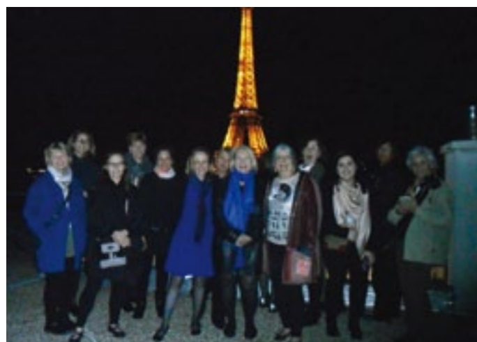
The evening's high point ... the rooftop view!