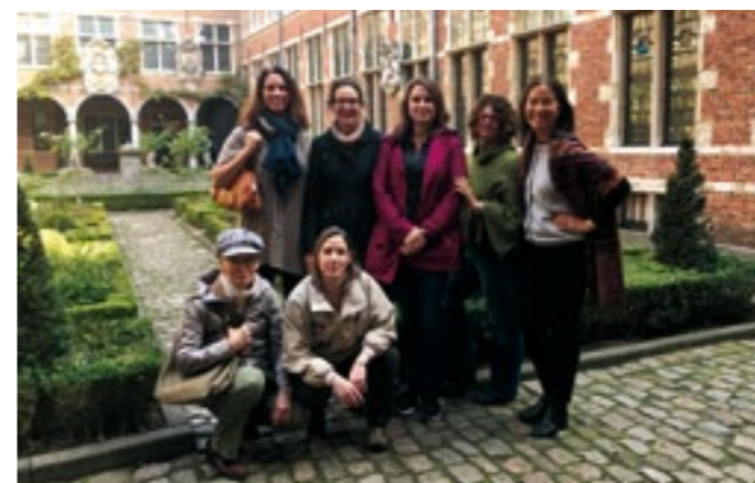
Region 4 participants on a walking tour of Antwerp

Our evening gala featured not only a performance by the Flanders Ballet School, an AWC Antwerp sponsored charity, but the presentation of a 10,000 Euro cheque to the Middelheim Hospital, part of our ongoing support for their creation of a new Caring Hearts Breast Lounge. Our aim was to share the magic and I think we succeeded.