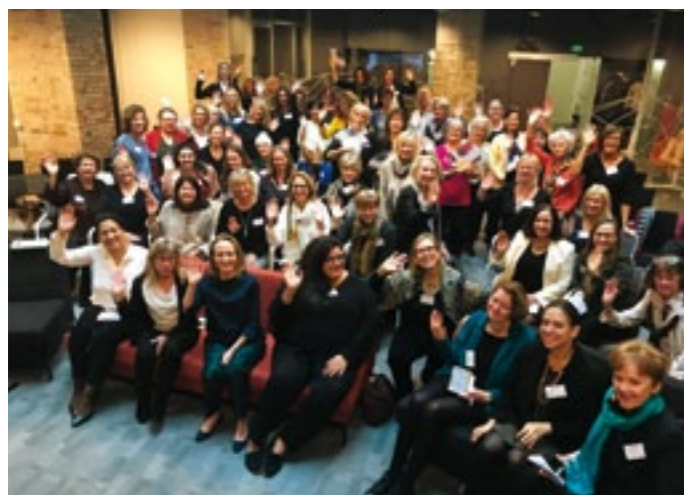
Region 3 hosted over 70 participants from France, Europe, the Middle East and the US.