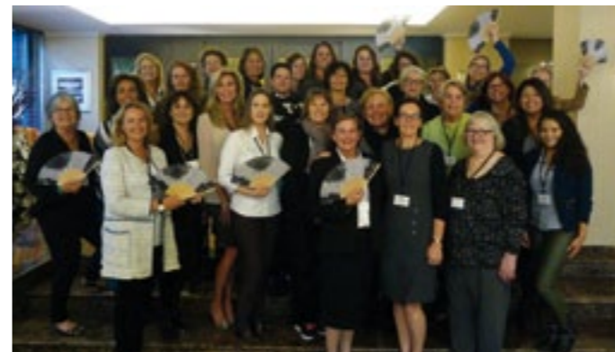
Region 4 participants showing that they are "fans" of The FAWCO Foundation.

Women Worldwide". We chose the kaleidoscope as a symbol for this Regional as it is made up of numerous facets: on its own, each individual facet has different colors, shapes and sizes, but the real magic happens when these facets come together.