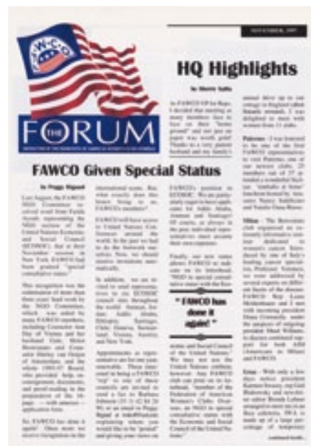
FAWCO Forum ECOSOC November 1997