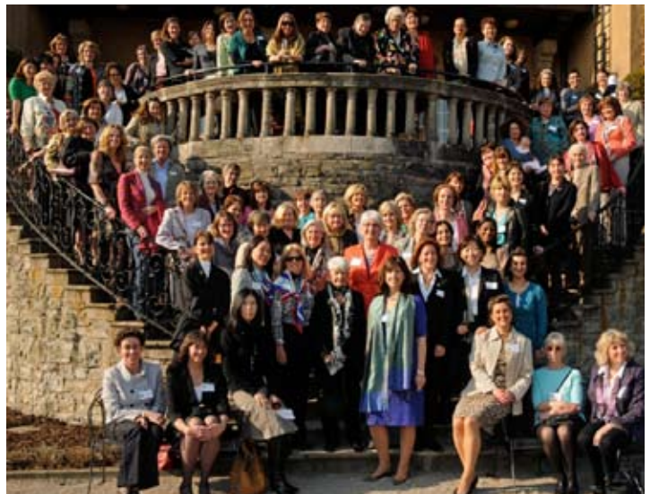
Some 90 AIWCC members joined for a high tea celebration at Bergisch Gladbach.