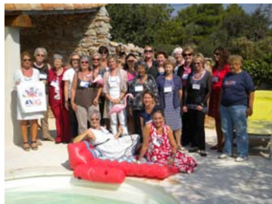
Region 3 taking a well-deserved break from their workshop sessions in Sete.