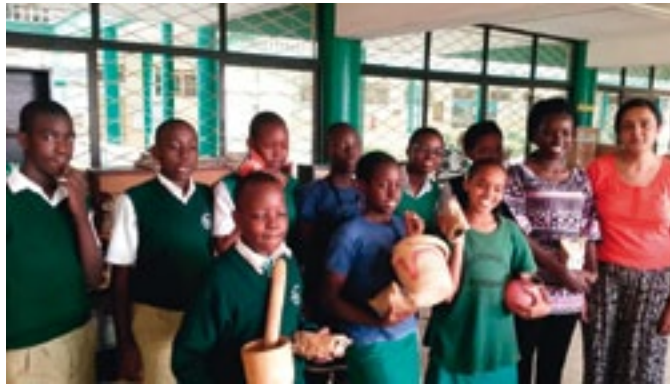
Workshop participants from Kisumu, Kenya