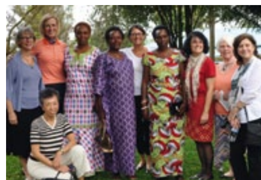
Participants of the HRTF tour explored women's political empowerment and human rights in Rwanda, pictured here with women from the NGO AVEGA.

Two decades after its horrific genocide, Rwanda has set a global example through its recovery, due in large part to the involvement of women. In October 2015, the FAWCO Human Rights Task Force (HRTF) offered a first-of-its-kind Strength of a Woman tour of Rwanda.