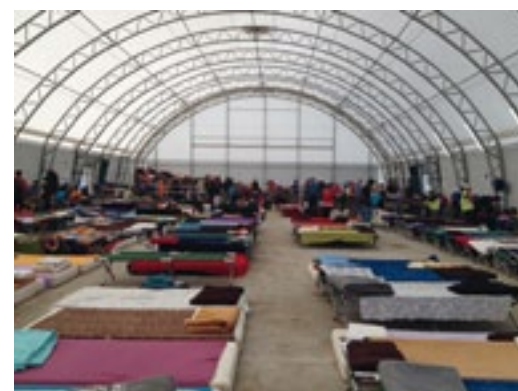
Red Cross shelter, Burgenland, Austria