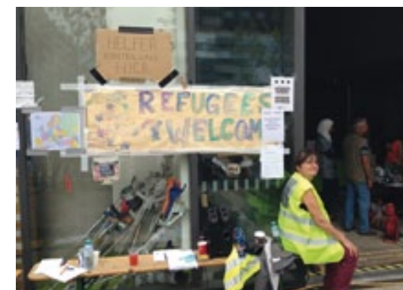
Refugees Welcome, at the Hauptbahnhof in Vienna, Austria

in March - for books, fees, uniforms, and school supplies for 45 refugee children.