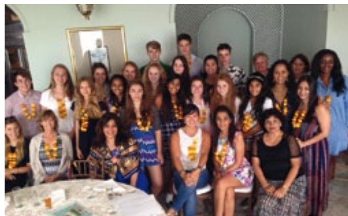
Cultural Volunteers at Opening Tea with their AWC Mumbai hostesses.

(continued from page 1) FAWCO Youth Program