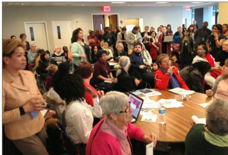
Panelists addressed a full house!