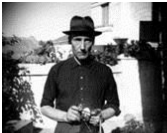
William S. Burroughs

17 Jan -30 Mar 2014 Taking Shots: The Photography of William S. Burroughs