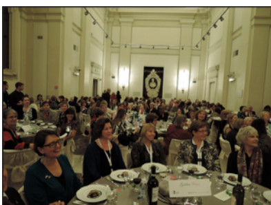
Residenza di Ripetta

For a slide show of the conference, click here .