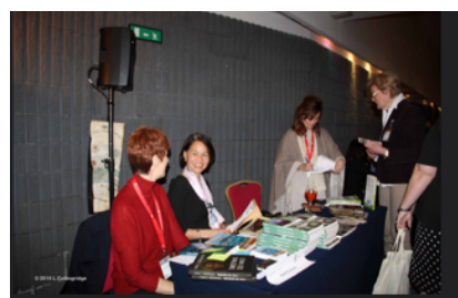
The book table