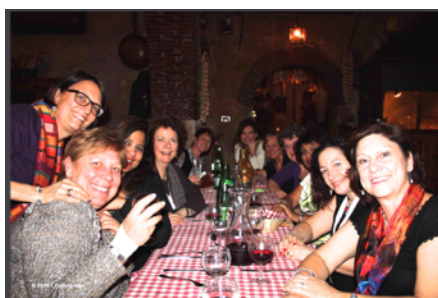
Taverna di' Mercanti