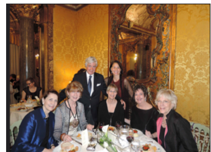
Nuova Circolo degli Scacchi