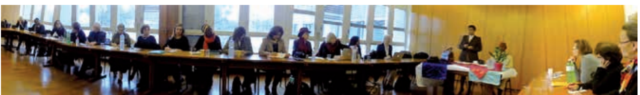
NGO CSW Geneva members meeting with UN Women Executive Director Phumzile Mlambo-Ngcuka on 15 January 2014

Regular members' meetings and communications provide a platform for networking, sharing of information, monitoring, and strategizing on joint advocacy projects. These notably include the elaboration of joint oral or written statements, and the organization of side-events at the Human Rights Council and other UN conferences.