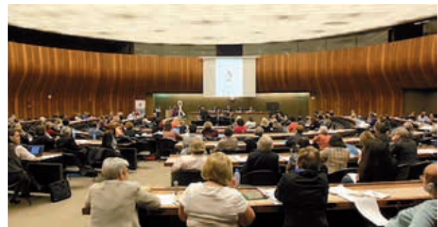
Image of the 'Men and Boys – In Solidarity for Gender Equality' Round Table at the UN in Geneva, 4 November 2014

Engaging men and boys has become essential for any discussion around gender equality issues. Acts and threats of violence, whether occurring in the home or in the community, or perpetrated or condoned by the State, instill fear and insecurity in women's lives and are obstacles to the achievement of equality, peace and development. By launching the White Ribbon Campaign in 2009 in Switzerland, the initiative joins about 60 countries that follow the original Call to Action to men and boys, and also to women and girls, to mobilize them to pledge not to commit, condone or remain silent about violence against women and girls. Women are speaking up and out, and men's voices need to be heard more loudly to make the end of violence a global reality.