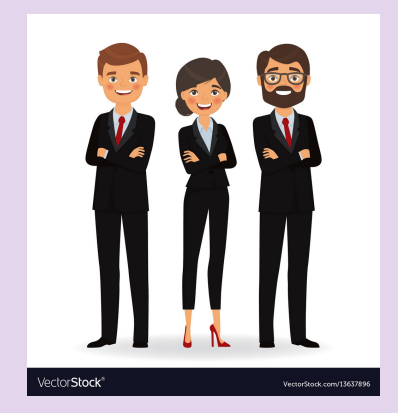
Young Adults 18-25

UNITED NATIONS YOUTH REP YOUTH ASSEMBLIES