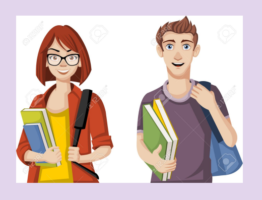
High School 15-18