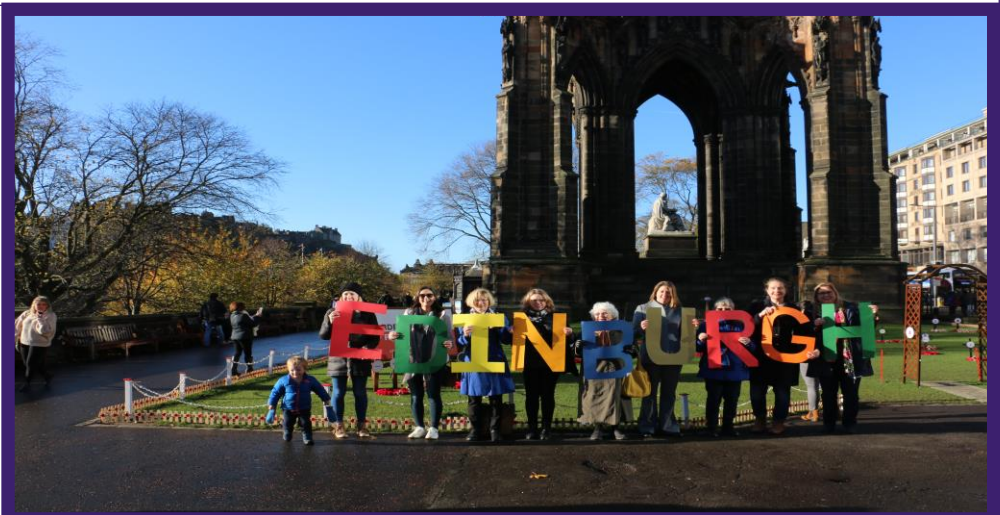
The American Women's Club of Central Scotland welcomes FAWCO to Edinburgh

One focus of her remarks that morning was on society's gender-equity challenges, supported with anecdotes from her own career. For example, directly after her election, she received many letters from girls who were delighted to see a woman was their First Minister. She reflected, "If you can't see it, you can't be it."