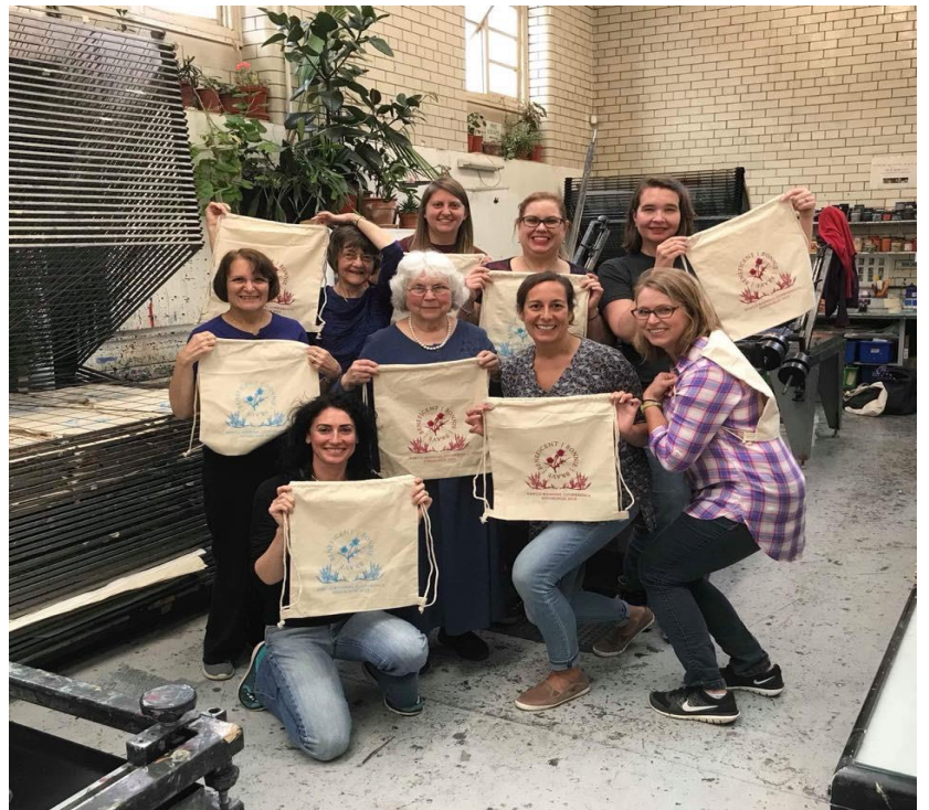
The American Women's Club of Central Scotland activity - Silk screening FAWCO Biennial Conference bags.