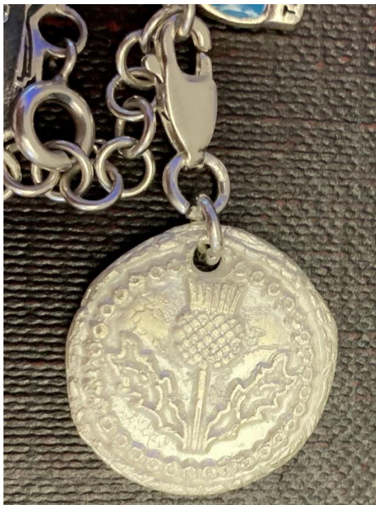
The FAWCO Biennial Conference Silver Charm – Handmade by AWCCS Members